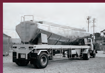
Manufactured the first tank trailer