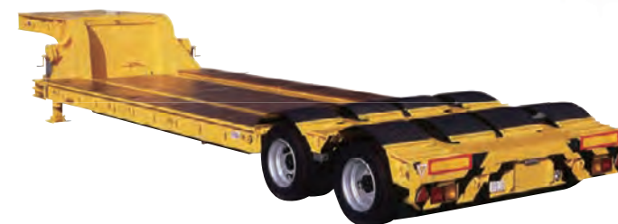
Low bed semi-trailer

A wing semi-trailer for accomplishing effective loading and unloading for large amounts of cargo due to its side full-opening structure.