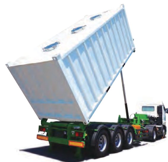
Container semi-trailer (Dump-up type)

Equipped with a diesel engine on the trailer side, it can unload powder and grain by tilting the container up to 46 degrees in about 60 seconds.