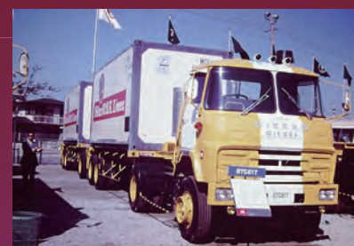
Exhibited at the 16th Tokyo Motor Show in 1969.