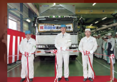
Achieved manufacturing 10,000 wing bodies