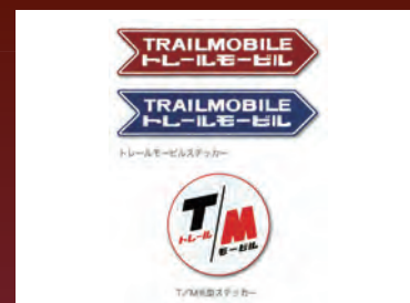
NIPPON TRAIL MOBILE was established