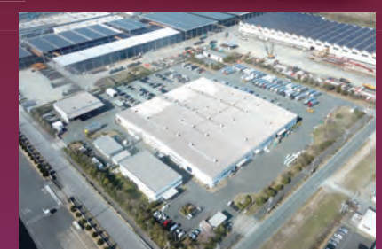
Established Mito factory