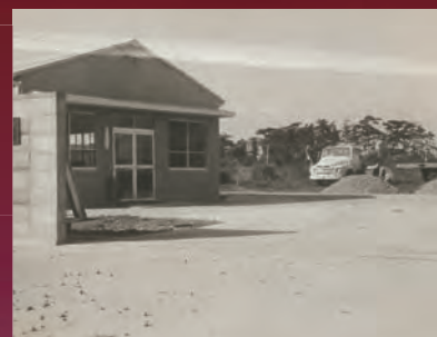
Head office and Factory at the time of foundation