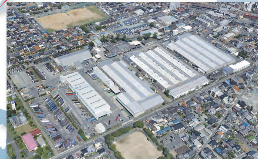
Head Office & Plant

We will continue to challenge of delivering "Japan Quality" to the world by utilizing our experience in Japan and the achievements in the world.