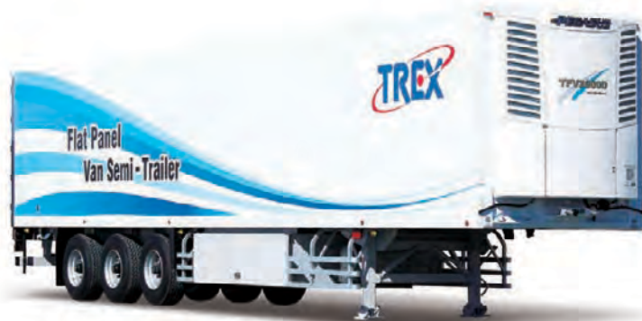
Flat panel van semi-trailer

With the diversification of the distribution industry, demand for trailers that handle large loads is increasing. We offer a wide-ranging variation of vehicles to meet the demands of this day and age to stay ahead of our competitors.