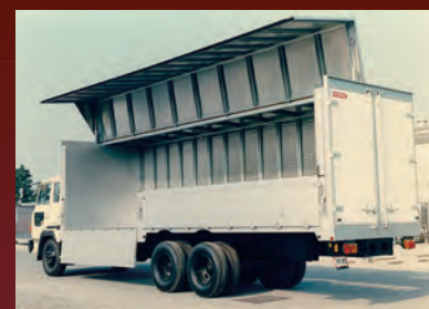
Started to manufacture Wing body