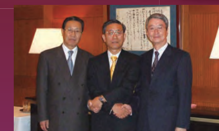
KYOKUTO KAIHATSU KOGYO CO., LTD. became our 100% share holder and Joined KYOKUTO group.