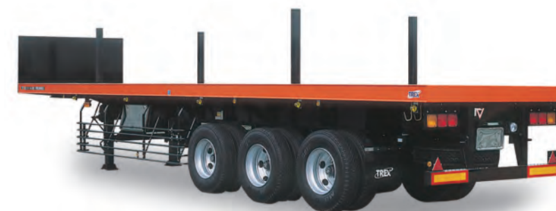
Flat bed semi-trailer

The top class rust-proofing powder coating supports a new era of container transport.