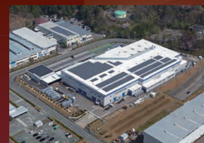
Established Otowa Factory (for wing body)